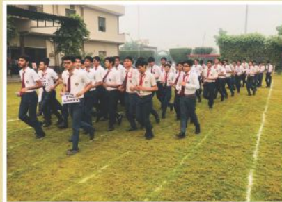
RUN FOR PEACE