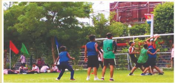
BOY'S NET BALL TEAM