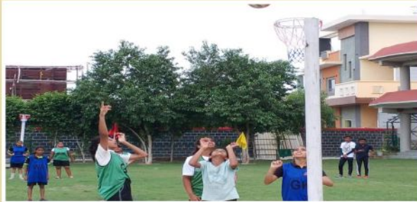
GIRL'S NET BALL TEAM